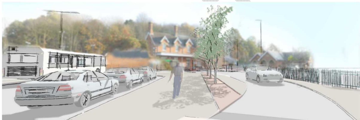
Artists impression of new interchange at West Malling Station

Disappointingly, financial contributions from the rail industry and the DfT have been absent. Nevertheless, we are looking to fund works through creative use of Section 106 monies from developments in this area.